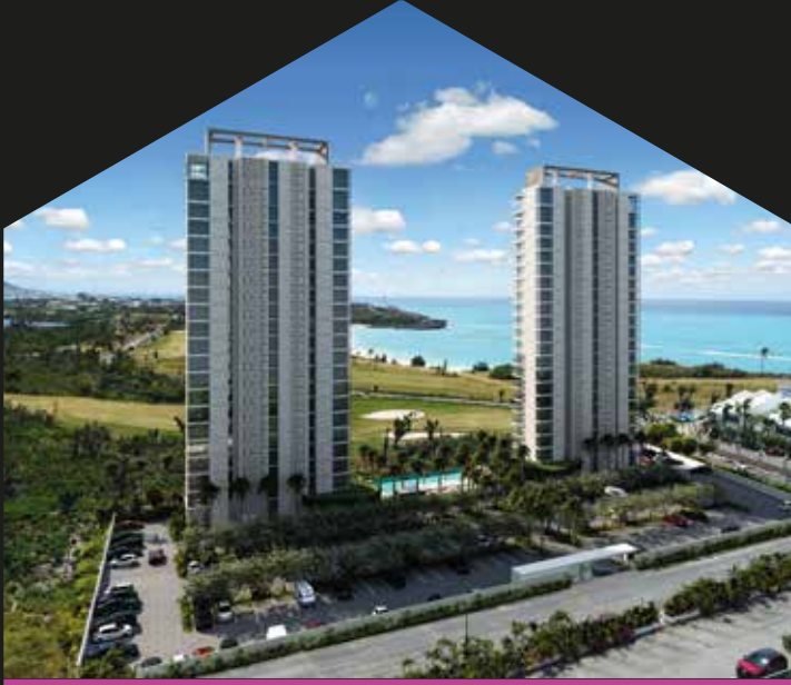
Fourteen Towers Mullet Bay