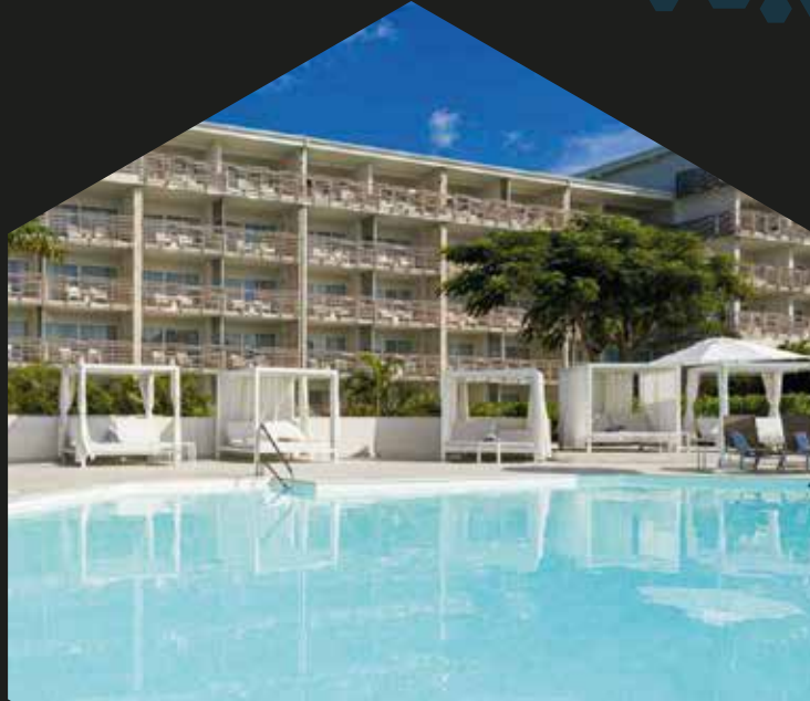
Ocean Point Sonesta

Was fitted with 3 elevators of between 4 to 6 floors in height and with a speed of 1 meter/second and a capacity of 1000 Kg each.