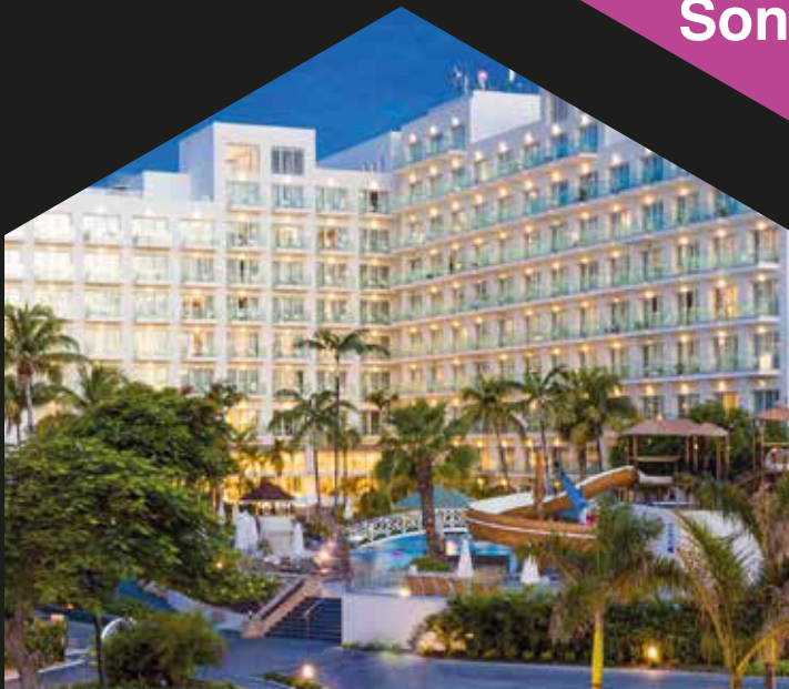
Sky Tower Sonesta