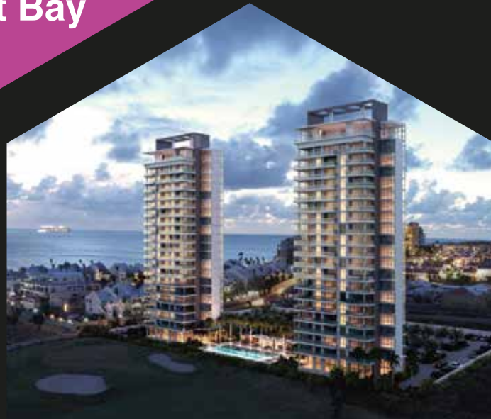
Fourteen Towers Mullet Bay

The height is 22 floors with panoramic cabin and landing doors fitted with ultra modern systems and energy saving gearless motors, which produces runs at low speed and does not consume it. Fairfailing systems for firefighters.